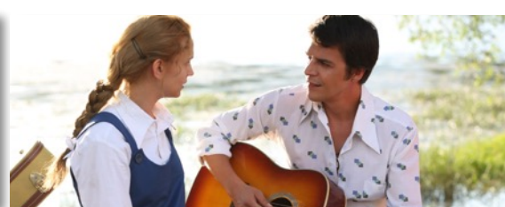
“ Whisper If I Forget ” (Dir. Cagan Irmak)