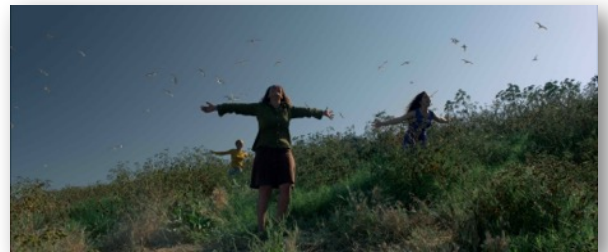
"Singing Women" (Dir. Reha Erdem)