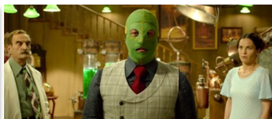
“ Coming Soon ” (Dir. Cem Yilmaz)